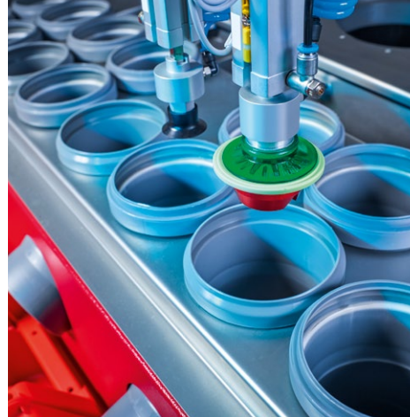
Block pieces are sorted automatically and prepared for quick reuse in the CCB Modulo blocker.