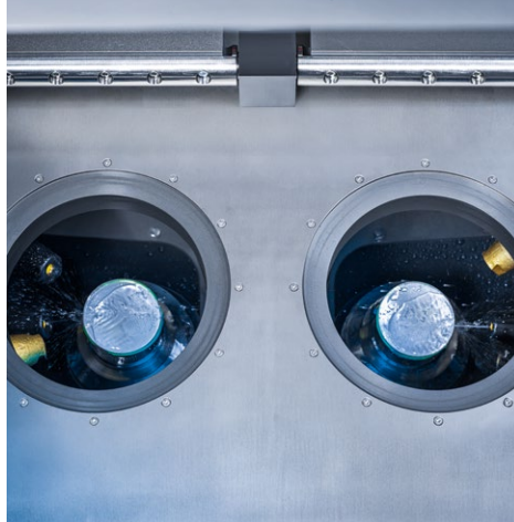
The design allows for deblocking and tape-stripping of two lenses at the same time.